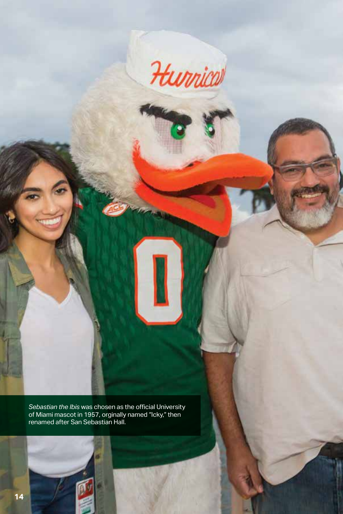
Sebastian the Ibis was chosen as the official University of Miami mascot in 1957, originally named "Icky," then renamed after San Sebastian Hall.