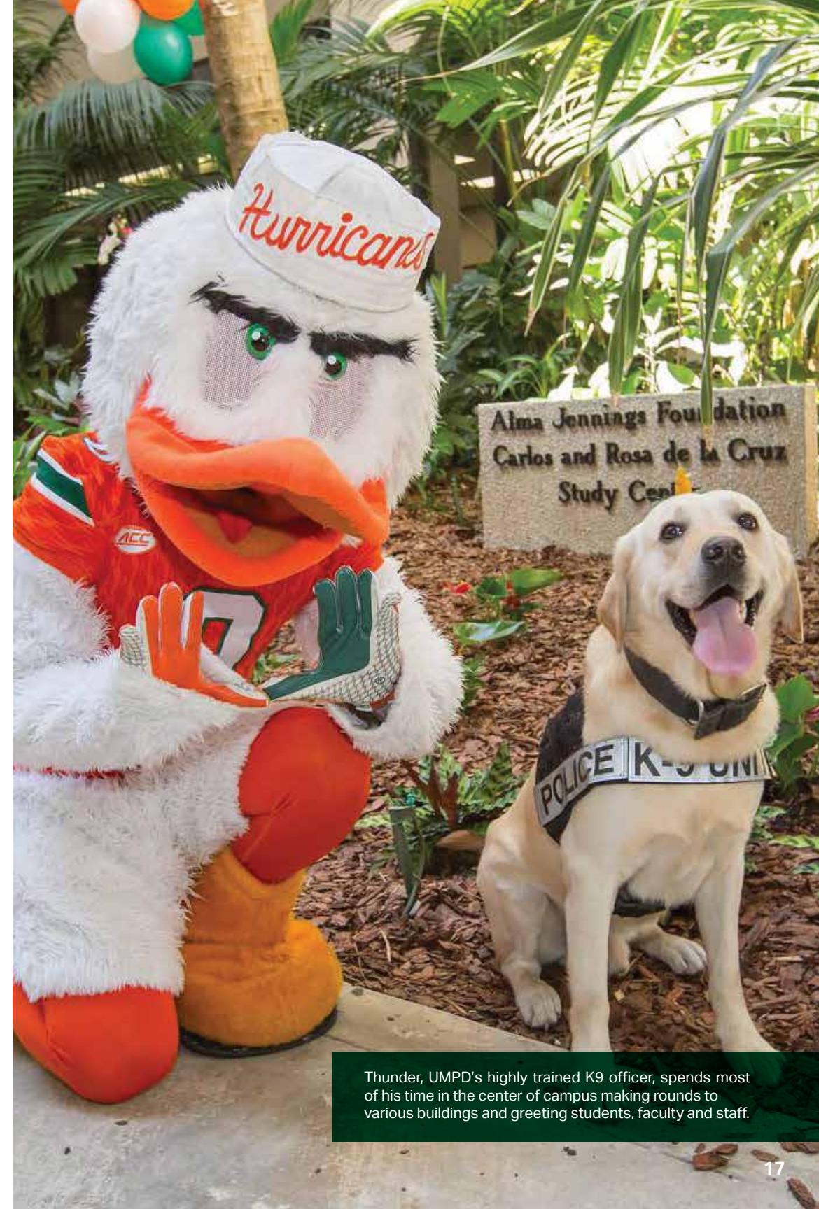
Thunder, UMPD's highly trained K9 officer, spends most of his time in the center of campus making rounds to various buildings and greeting students, faculty and staff.

When calling UMPD via the app's one-button call feature, information, including GPS location and relevant medical information, will be sent to the dispatch center. There is also a virtual escort feature where users can notify their designated contact that they are traveling from one destination to another.