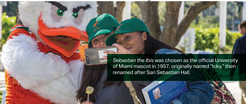
Sebastian the Ibis was chosen as the official University of Miami mascot in 1957, originally named "Icky," then renamed after San Sebastian Hall.