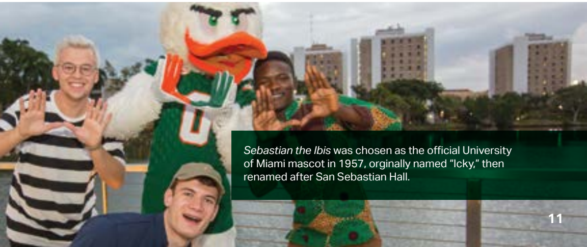
Sebastian the Ibis was chosen as the official University of Miami mascot in 1957, originally named "Icky," then renamed after San Sebastian Hall.

Supports a variety of recreational activities including intramural sports, club sports, fitness classes, and wellness programs housed at the Patti and Allan Herbert Wellness Center.